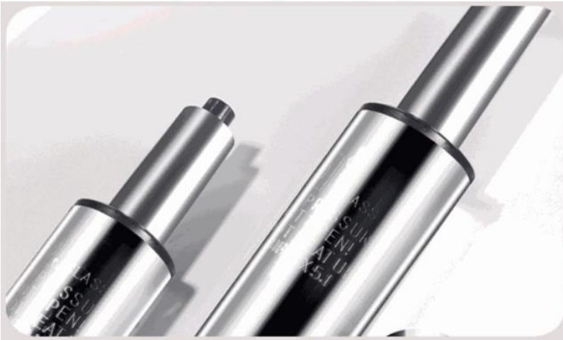
Gas lift with good quality.