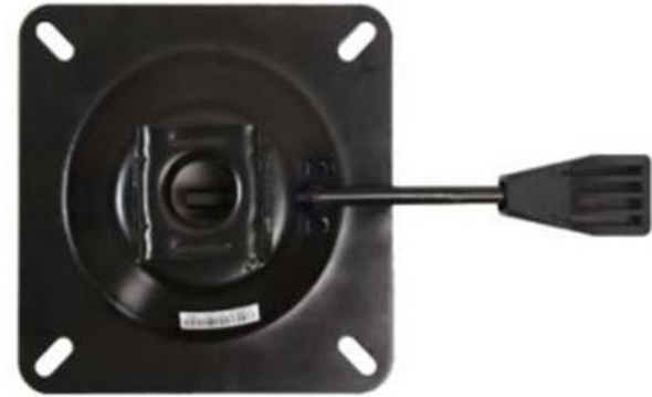
seat height adjustment system