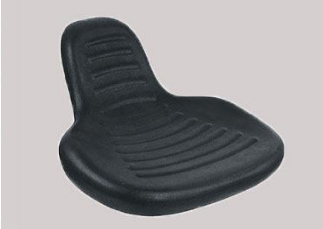
Made of PU foam with good quality.