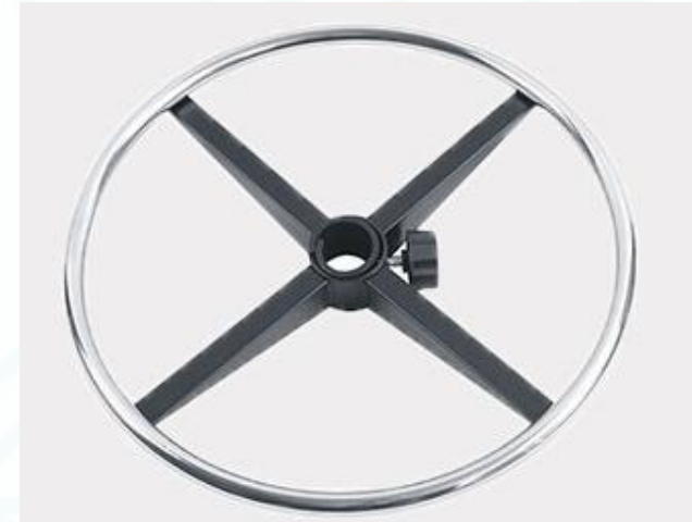
Foot ring can be removed.